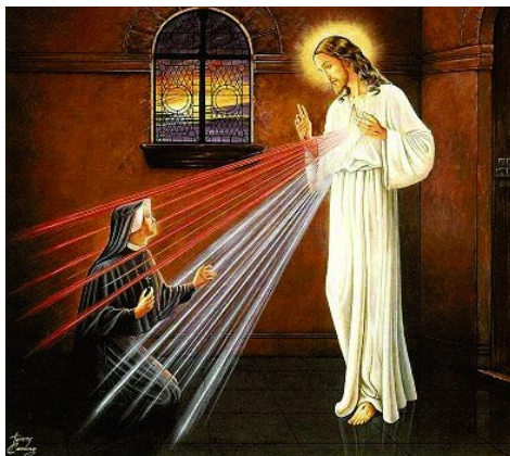
(St. Faustina—Based on 1, 78)

Help me, O Lord, to forgive and forget. This is Your greatest gift to me, and should be mine for Your sake, to all who offend me.