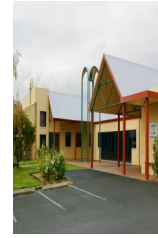
St. John the Baptist

The Parish has been entrusted to the Salesians of Don Bosco since 2000